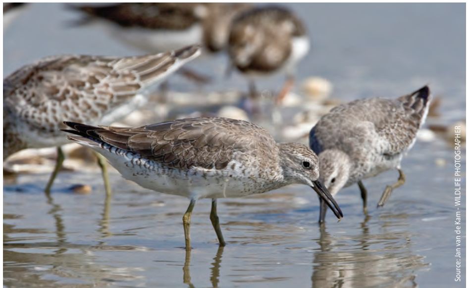
Red Knot – threatened by reclamation projects at Caoofedien, China

Land reclamation is a misleading phrase. It is not the process of 'reclaiming' or bringing dry land back. Land reclamation is a change of habitats. Tidal flats are not land. They are