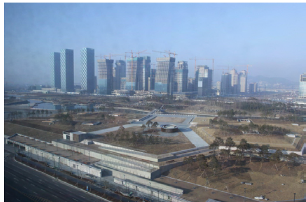
The view over Song-do, once an important tidal flat

myself on behalf of AWSG, to enhance existing national and flyway waterbird monitoring programs and include habitat mapping and threat assessments for important sites. The objective of this is to develop a web based 'Decision Support Tool' that would make available the up-to-date information on the status of migratory waterbirds and their habitats. (Copy of proposal available if interested).