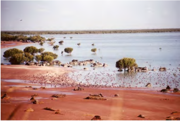
Mixed wader flock at Roebuck Bay, north-western Australia

The AWSG's long-term monitoring program of high tide roost counts in the non-breeding areas – particularly in the stronghold of Grey-tailed Tattlers and Terek Sandpipers of north-western Australia – will eventually reveal the full impact of habitat loss in southeast Asia. Ongoing banding and flagging throughout the EAAF will continue to accumulate data on movements. Moreover the increased use of light-level geolocators and satellite transmitters will lead to a more detailed insight into the migratory strategies of different shorebird populations. Together these datasets will underpin the conservation of Grey-tailed Tattlers, Terek Sandpipers and the many other shorebirds that use the EAAF.