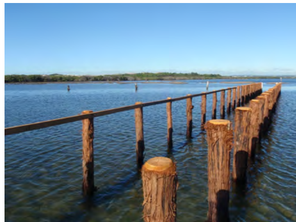
The artificial roosts are 48 posts half of which are joined by a rail. These mimic oyster lease structures the birds are known to use.

Two trial artificial roost structures for shorebirds will be installed within the Towra Point Aquatic Reserve in Quibray Bay and at Pelican Point in Botany Bay.